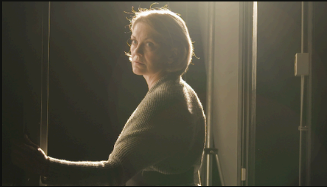
Bed Among The Lentils Alan Bennett amsterdam and national tour