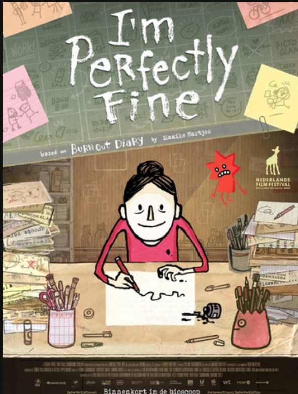
I'm Perfectly Fine Dario van Vree animated film 30'