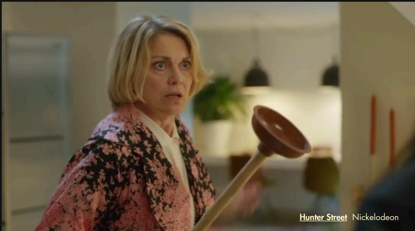
Hunter Street Nickelodeon